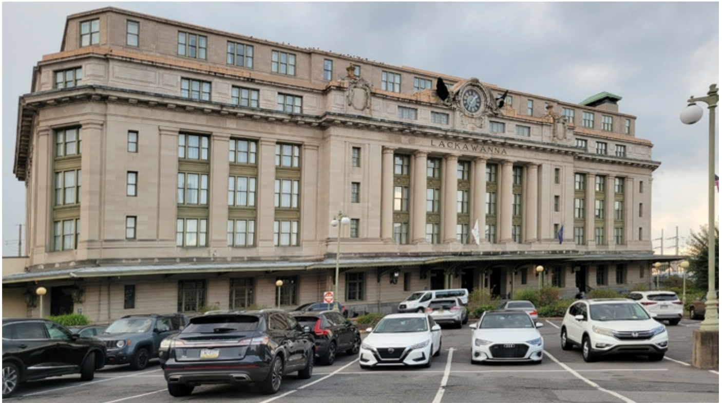
The Ex-Lackawanna Railroad Station which is now the Radisson Lackawanna Station Hotel in Scranton Pennsylvania.