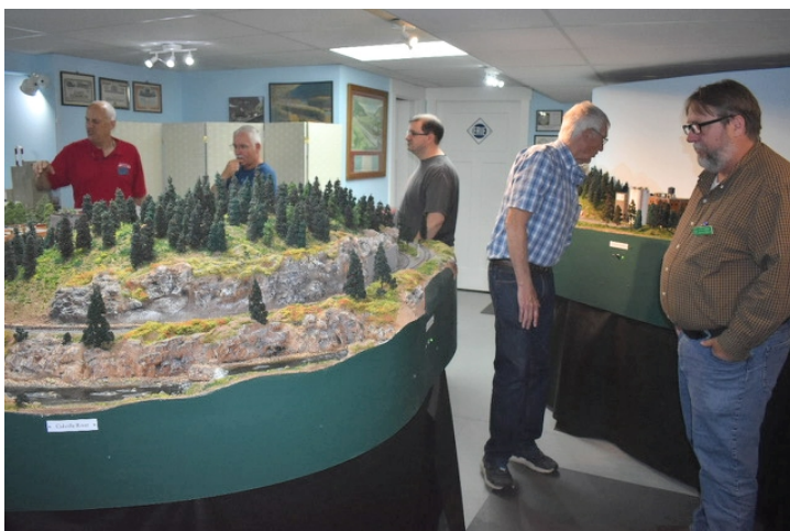
Drew James Layout