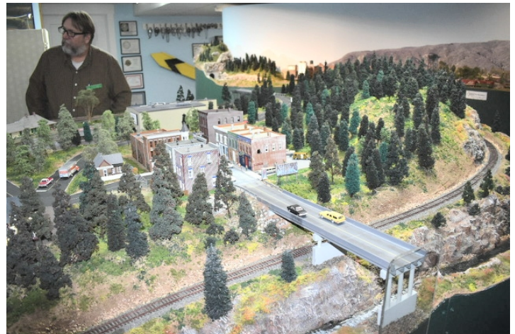
Drew James Layout