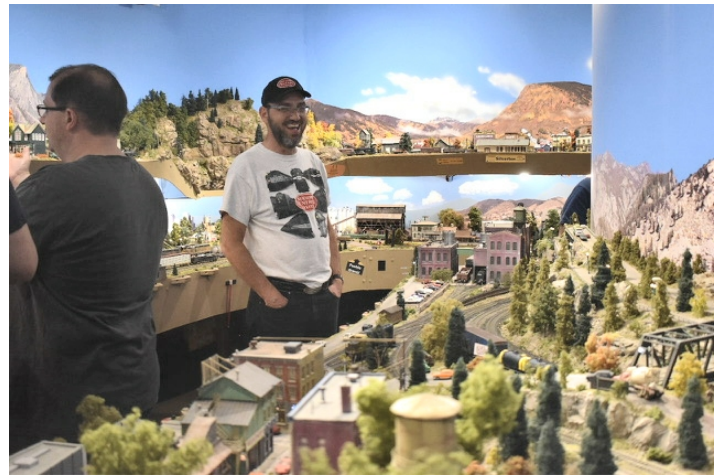
Bill Brown Layout