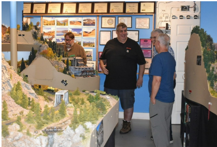
Bill Brown Layout