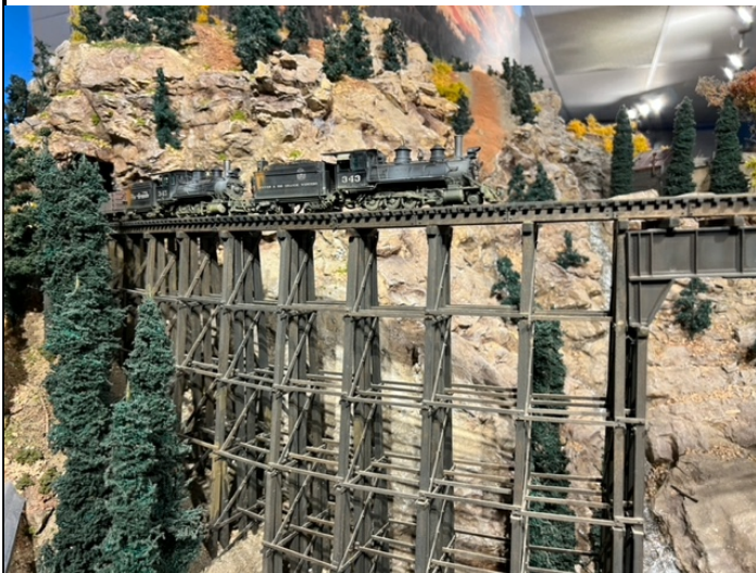
Bill Brown Layout

We ended the day with a Pizza buffet at Twin Trees Pizza and a meeting.