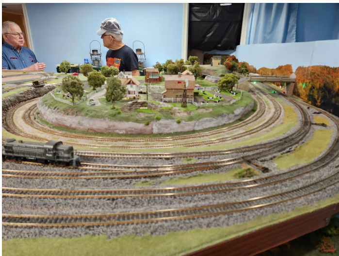
Bob Wilkins Layout