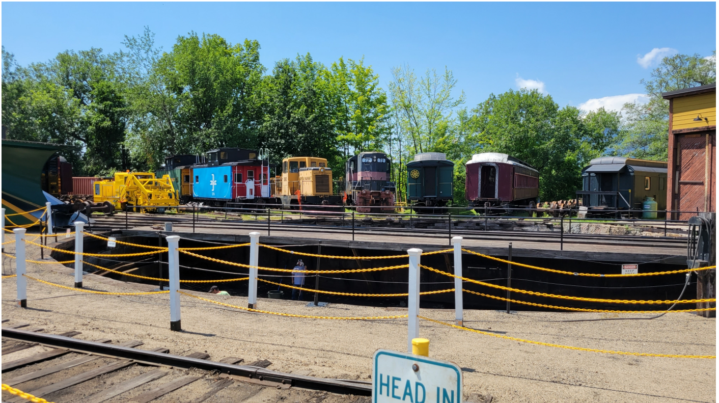
The turntable and roundhouse at the Conway Scenic Railroad. North Conway, New Hampshire, July 19, 2022.