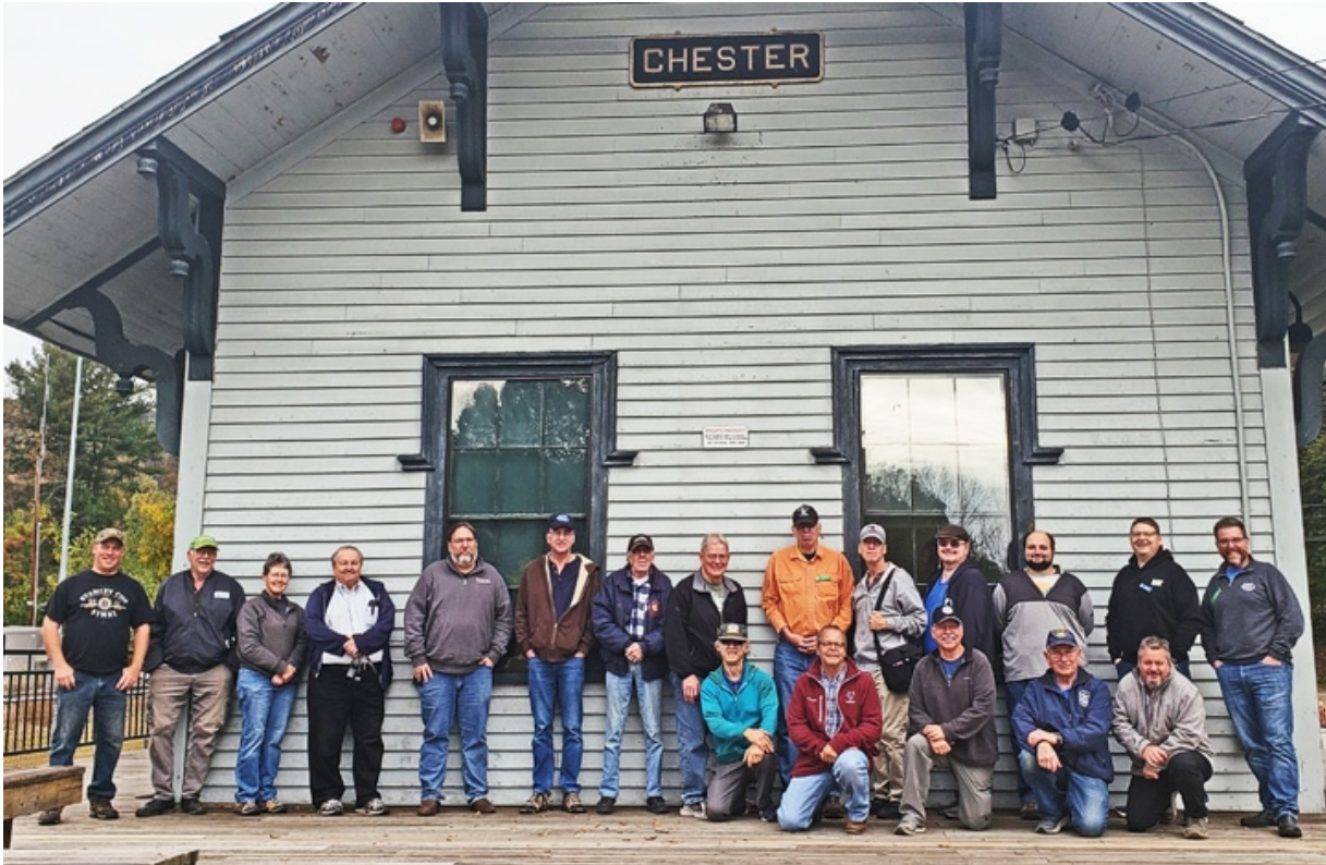
HBD Members at the Chester Railway Station & Museum