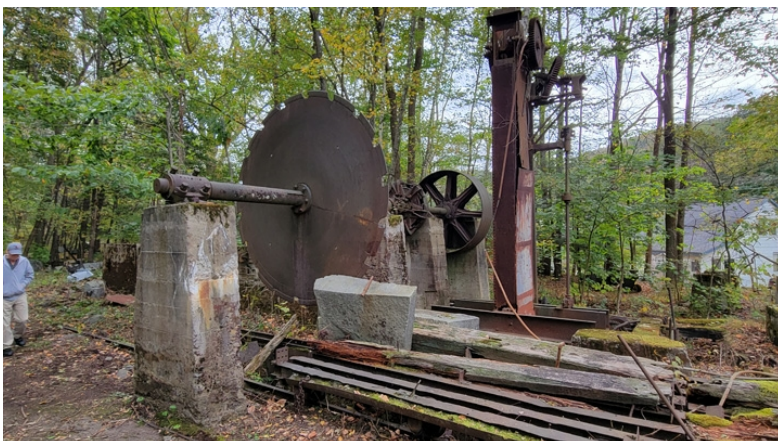
Hudson and Chester Granite Works site across the street from the Chester Railway Station & Museum