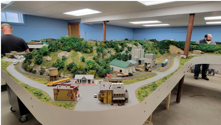
Tom Beck Layout