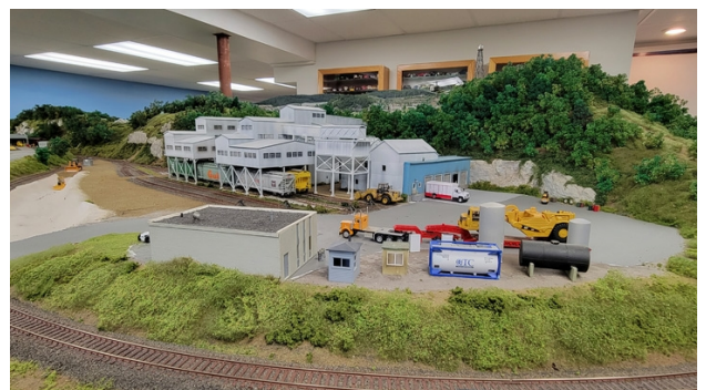
Tom Beck Layout