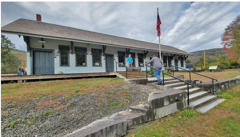
Chester Railway Station & Museum