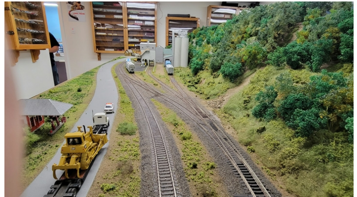
Tom Beck Layout