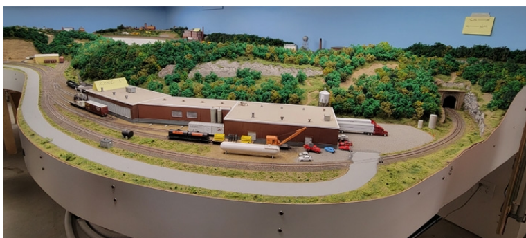
Tom Beck Layout